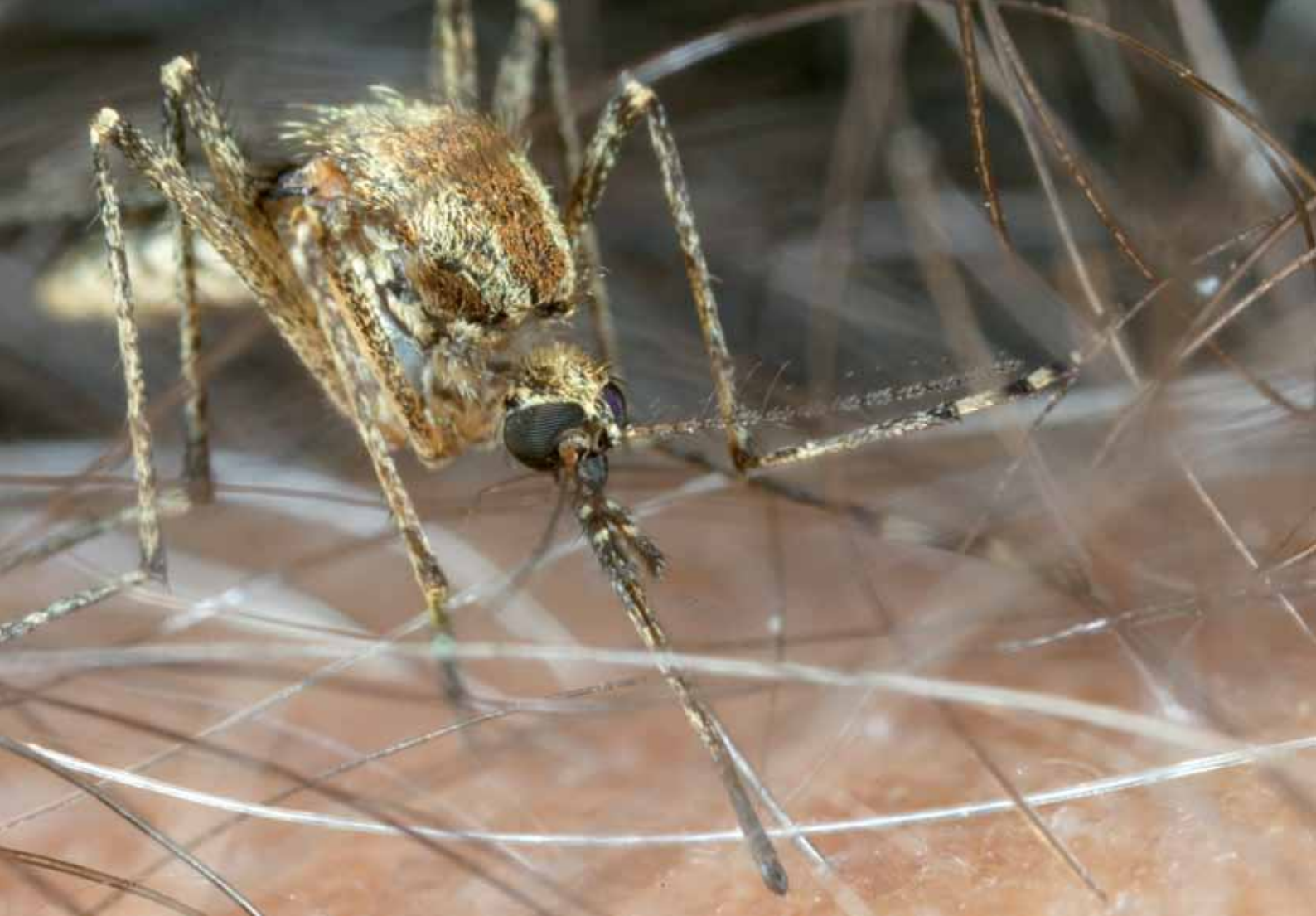
Figure 2. British mosquitoes