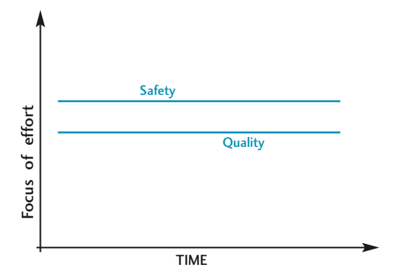
Figure 2b. Equal focus by chef on safety and quality throughout production