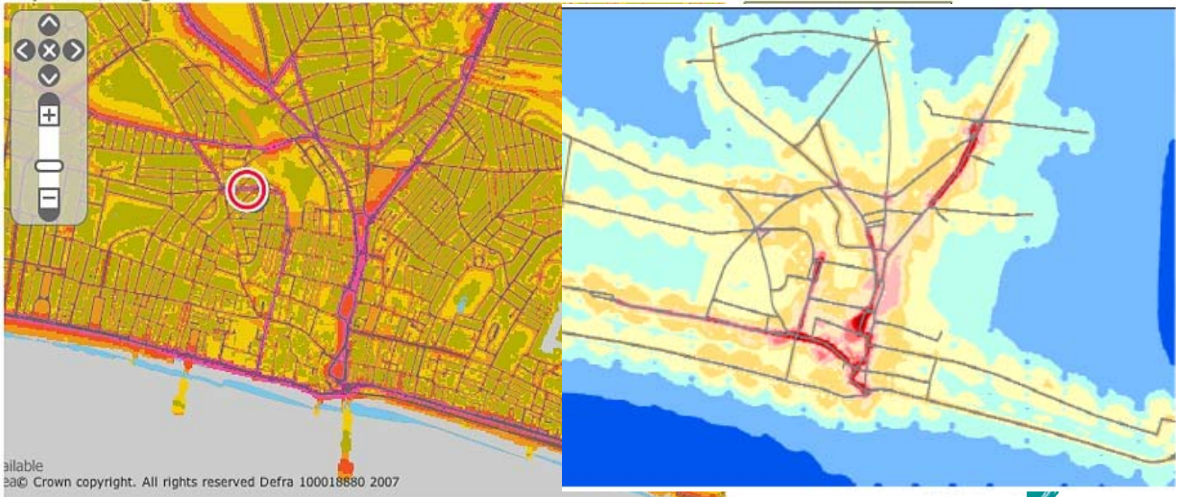
Map: BN1, Brighton