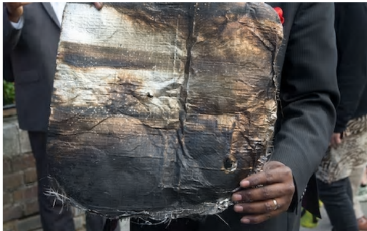
A local residents holds a section of the burnt cladding which fell from Grenfell Tower during the blaze