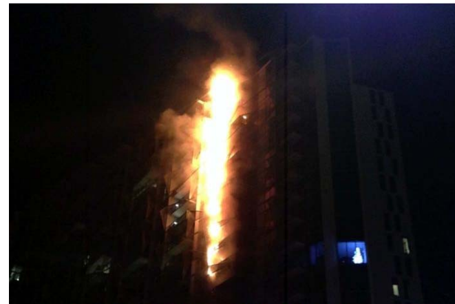
PHOTO: Aluminium-composite cladding was used on the Lacrosse building that caught fire in 2014.

Four Corners Anne Davies, Debbie Whitmont and Patricia Drum Updated 5 Sep 2017, 3:44am