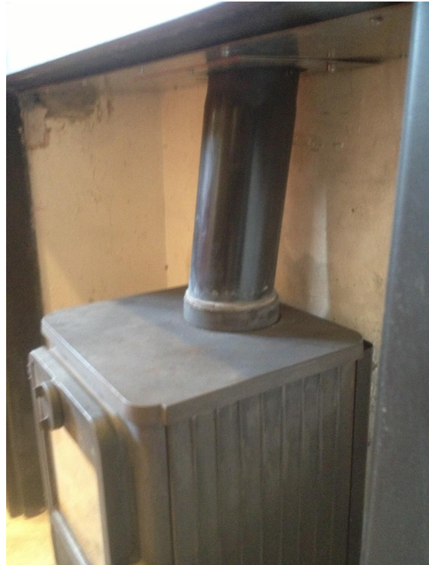
NON COMPLIANT FLUE CONNECTION