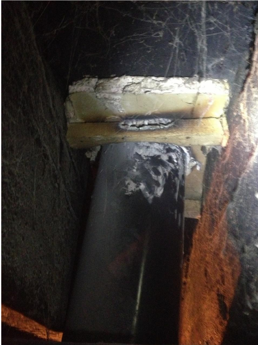
FIRE RISK IN FLUE CHAMBER