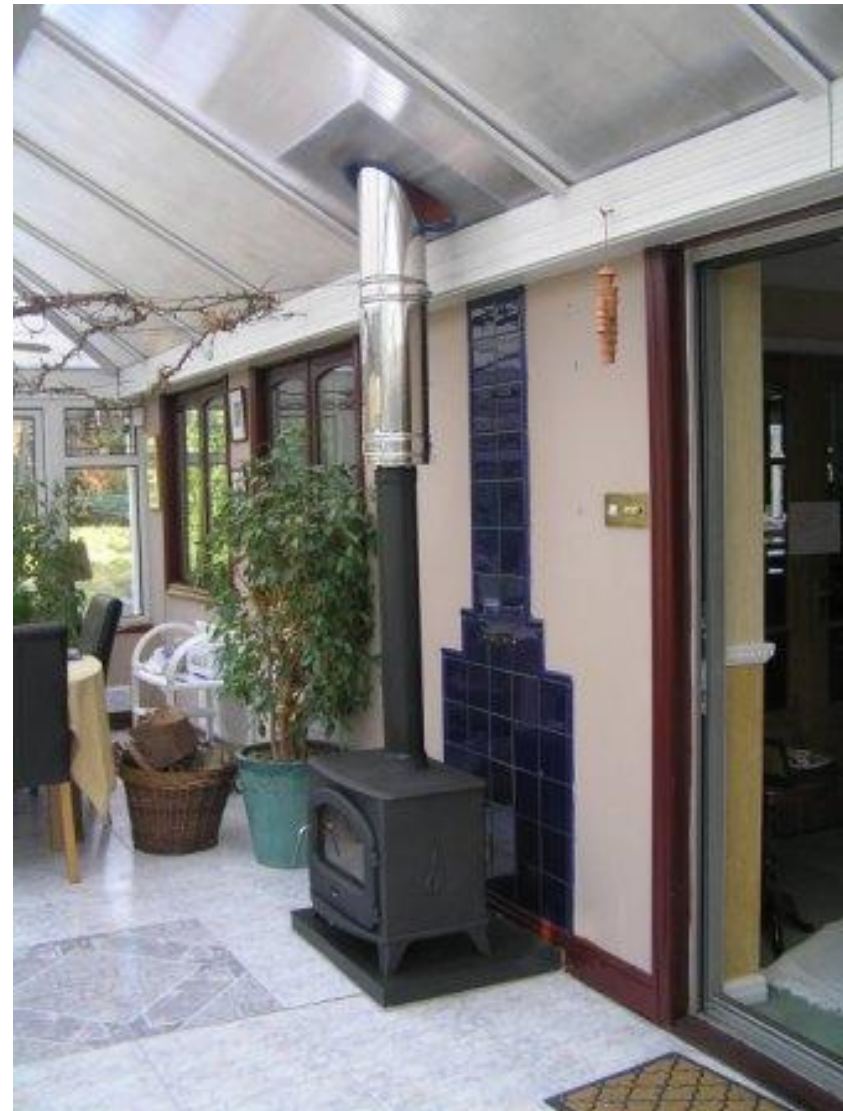
TWIN WALL INSTALLATION TO A CONSERVATORY (FIRE HAZARD)