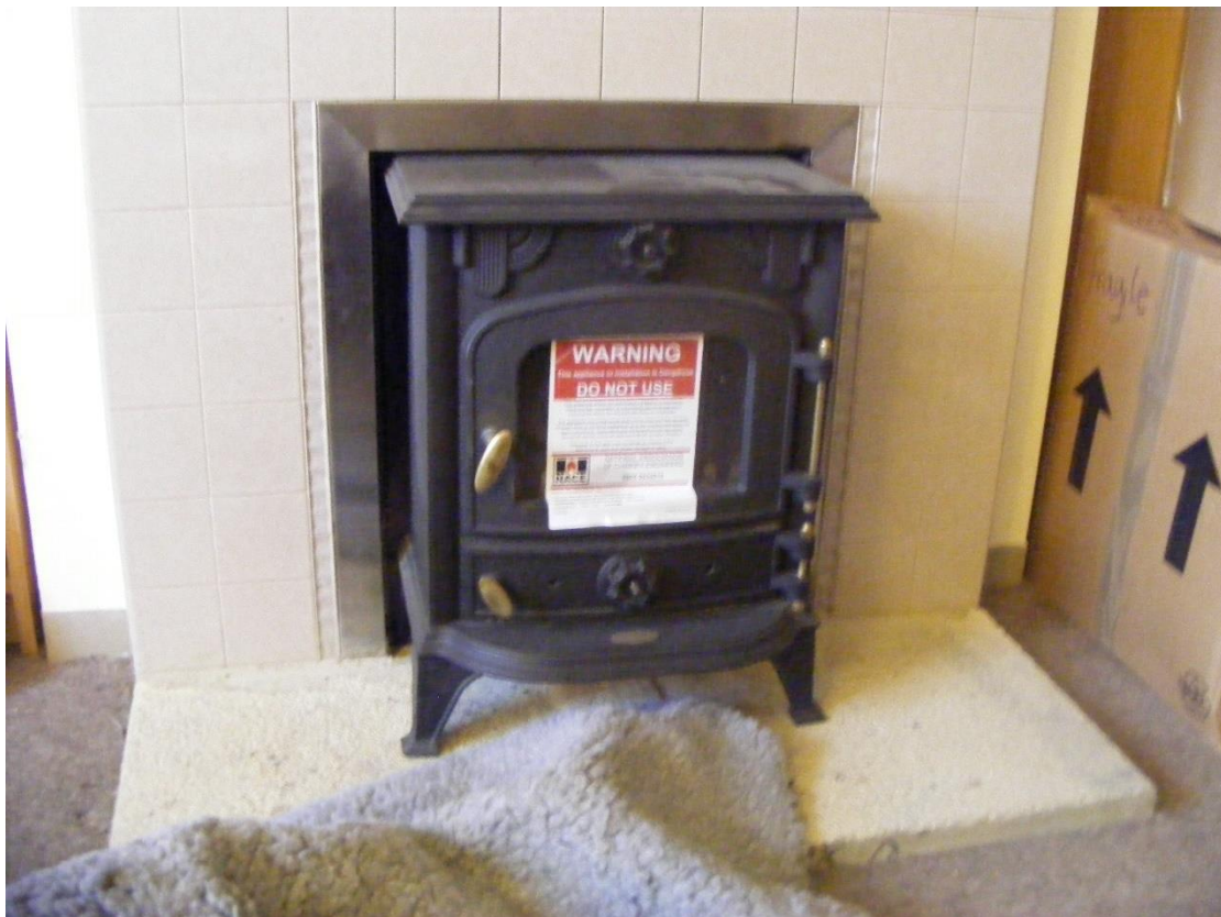
DEFECTIVE INSTALATION – NO THERMAL SPACING