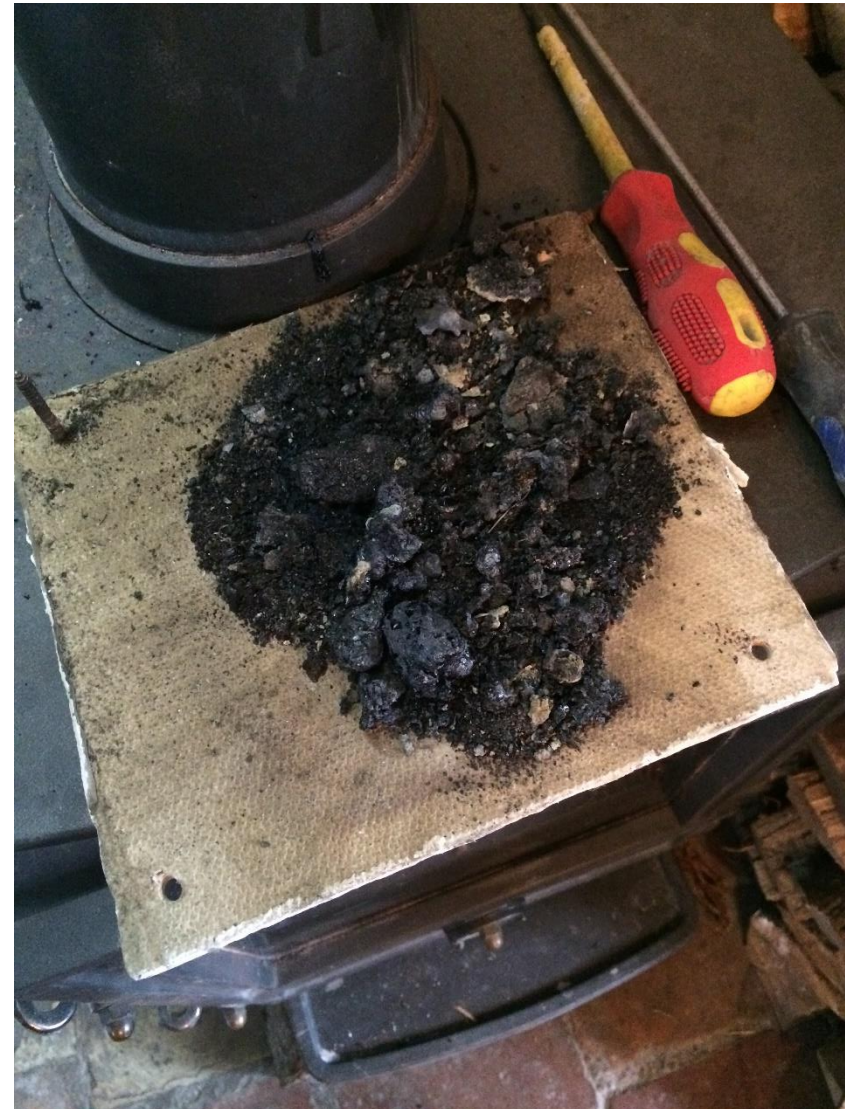
BITUMINIOUS MATERIAL REMOVED FROM INSPECTION PLATE