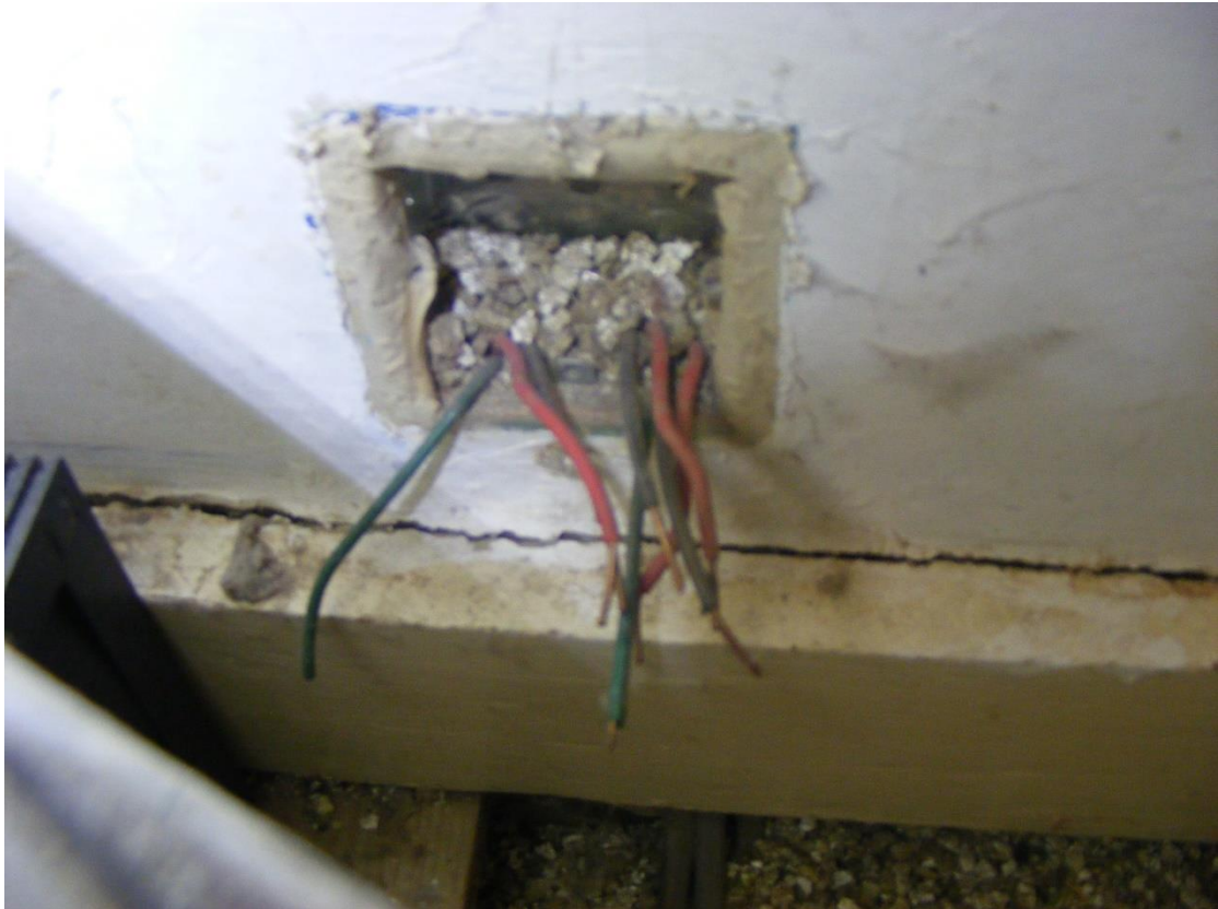
LIVE CABLES ADJACENT TO TWIN WALL CHINEY SYSTEM (2)