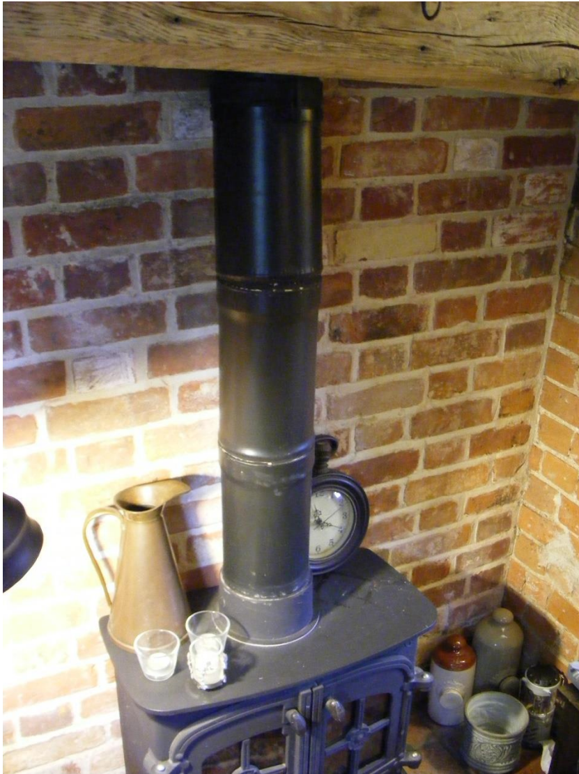
INCORRECT FITTING OF CONNECTING FLUE SECTIONS