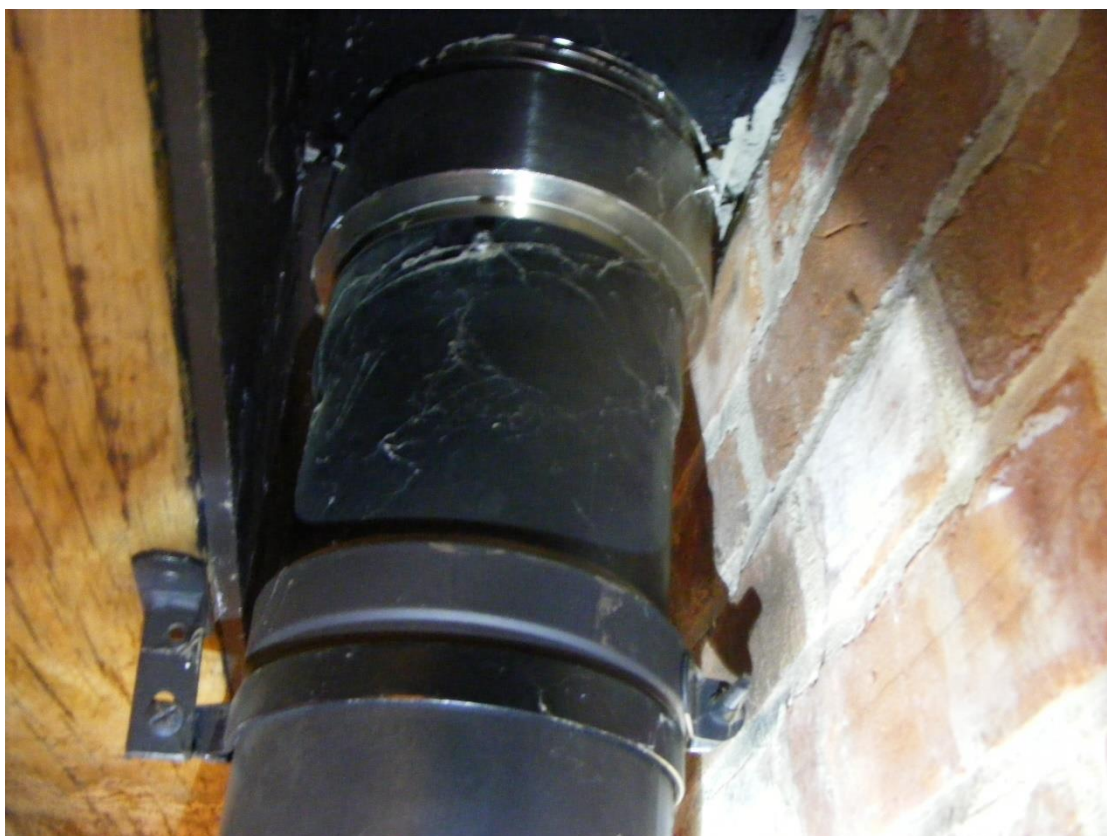
DIRECT FIRE RISK TO SUPPORTING TIMBER BEAM