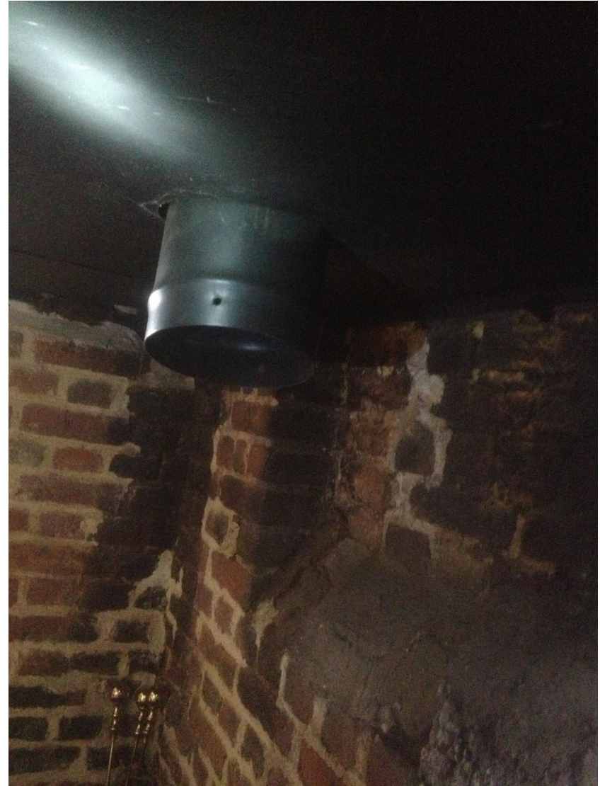
VITREOUS CONNECTING FLUE READY FOR USE