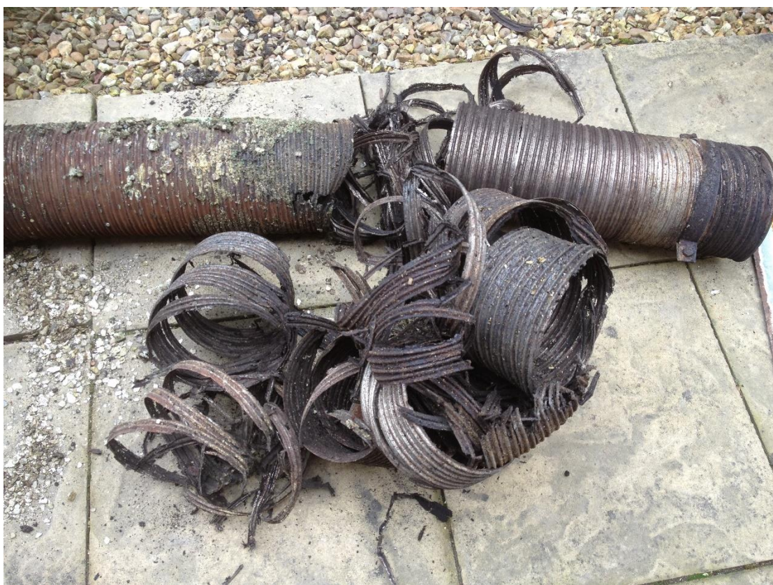
FURTHER FAILURE OF 904 LINER (2)