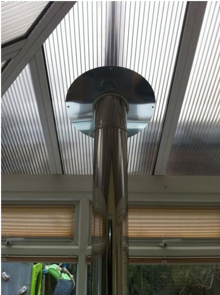
CONSERVATORY FIRE RISK