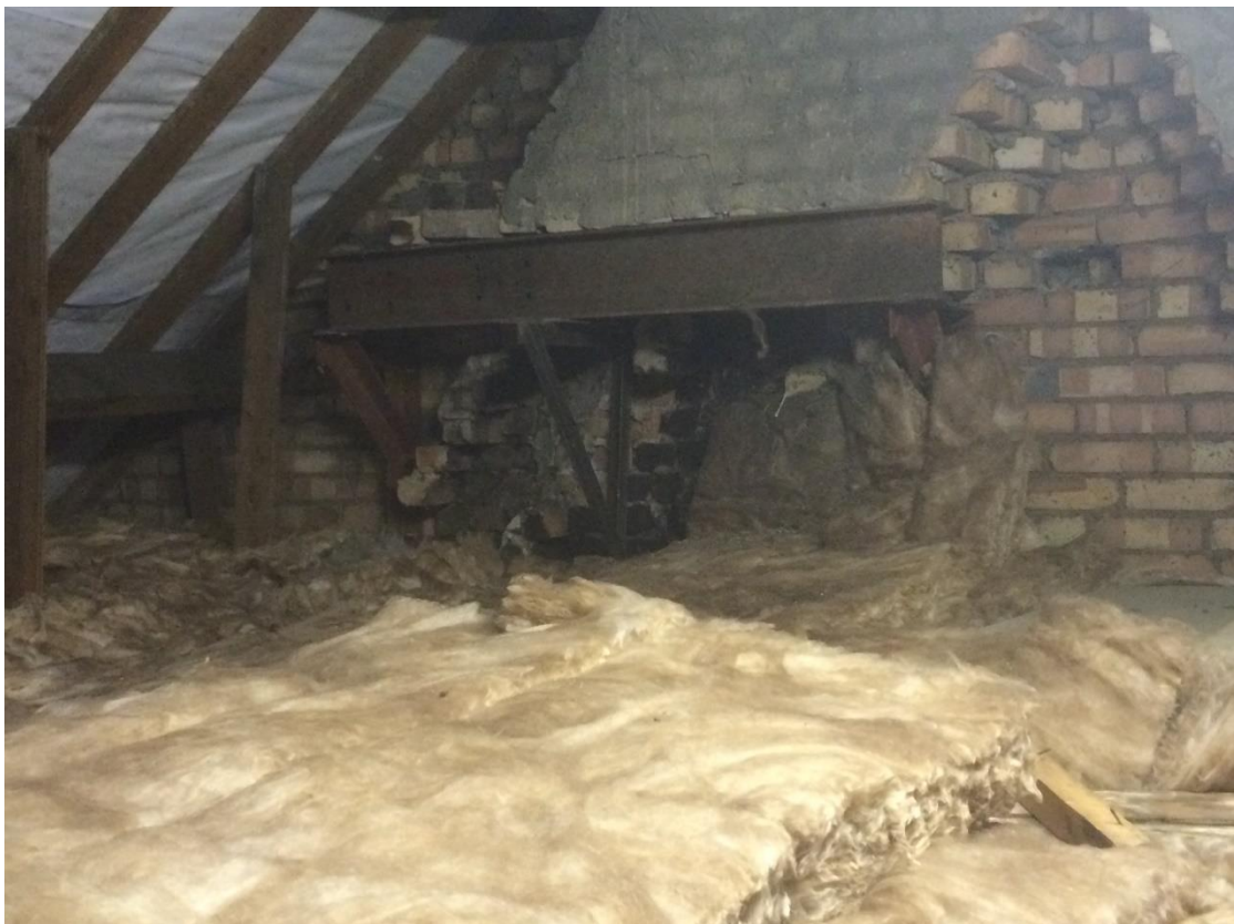
REMOVAL OF 2.NO MASONRY FLUE SHAFTS IN ROOF SPACE