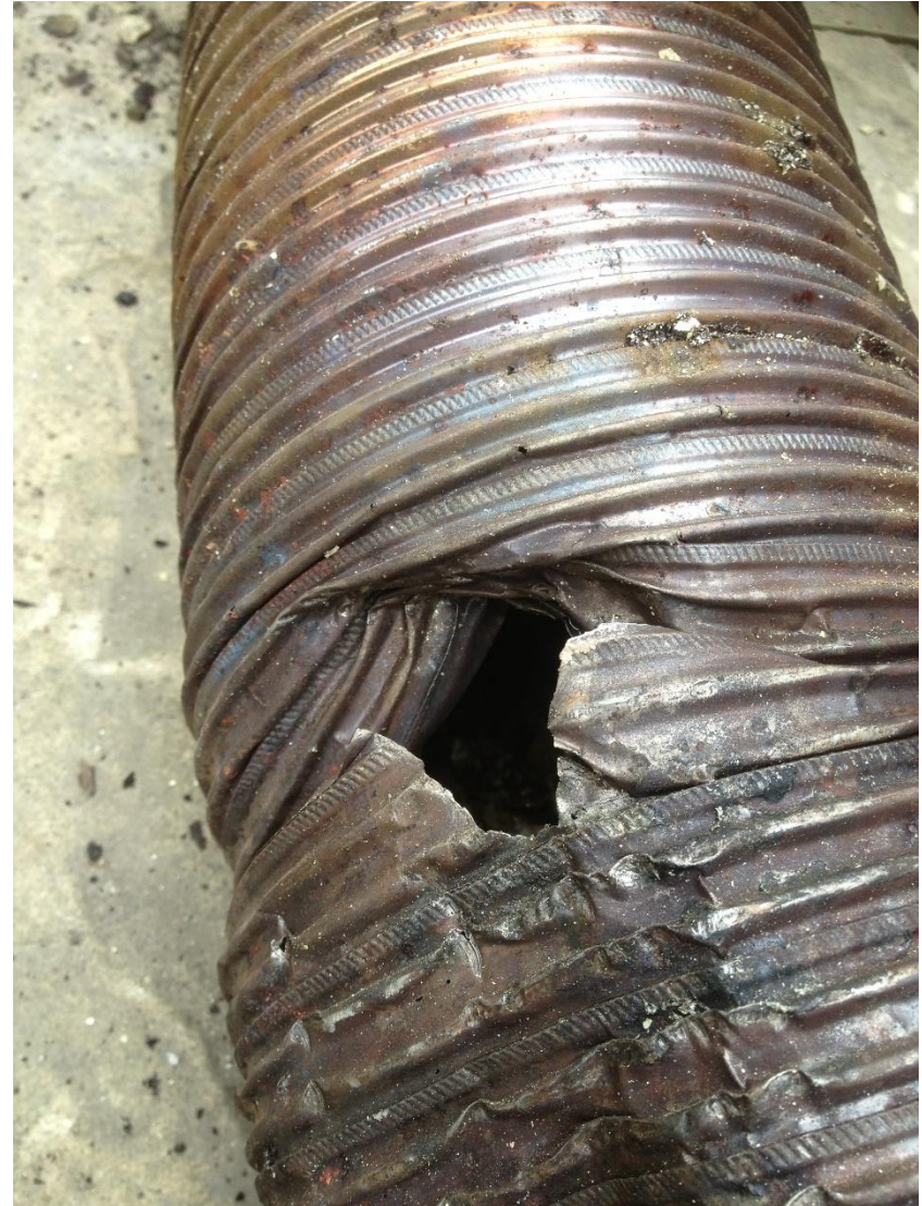
FURTHER FAILURE OF 904 LINER (1)