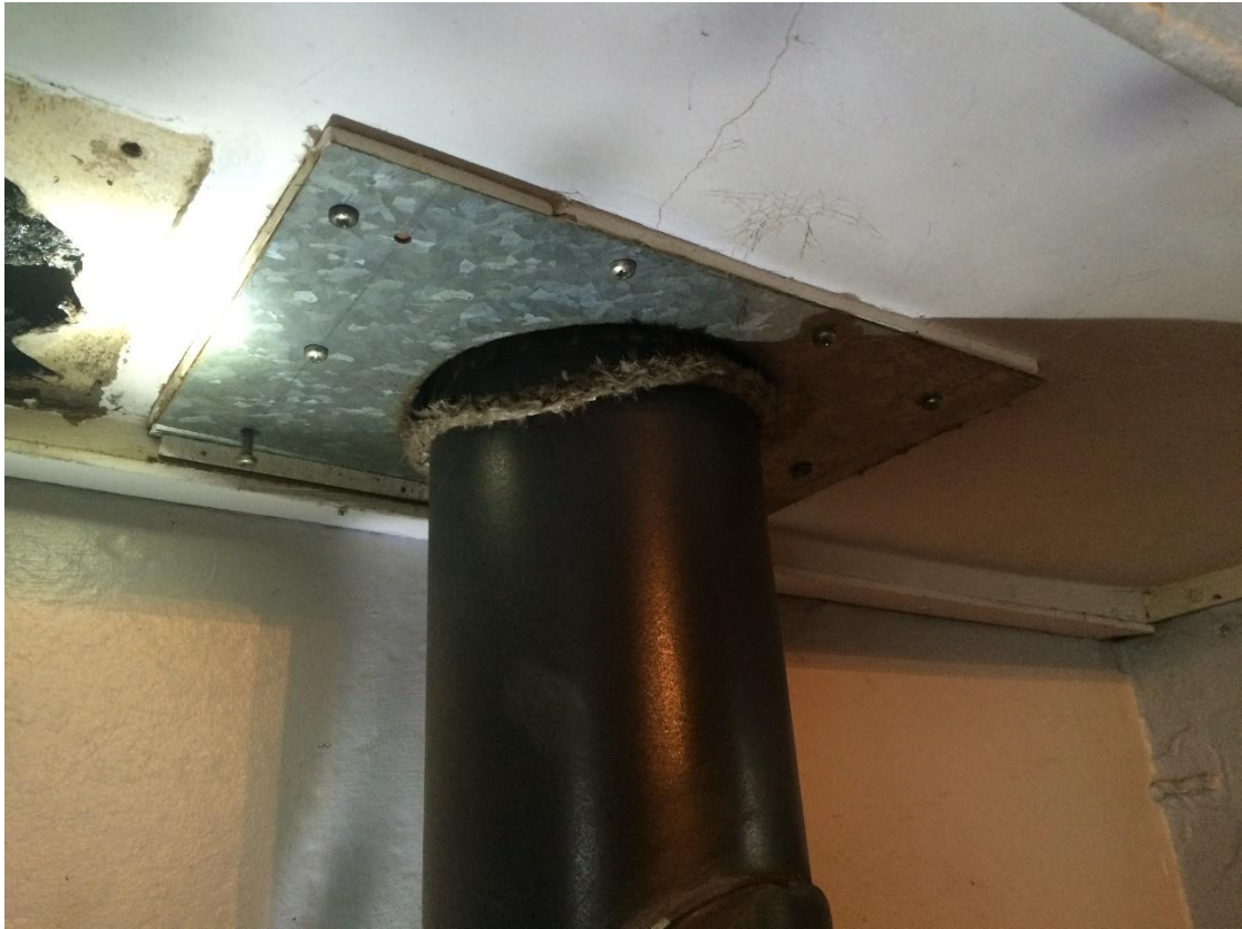
ASBESTOS CLAMPED TO PLASTERBOARD CLOSURE PLATE