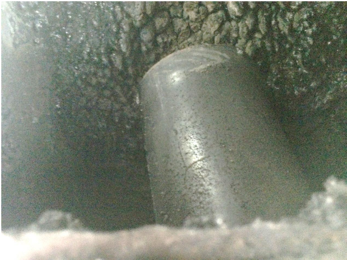
DANGEROUS TERMINATION OF CONNECTING FLUE