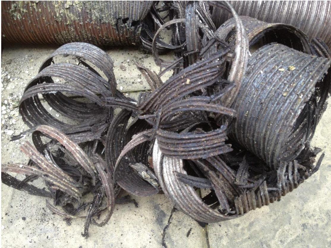
FURTHER FAILURE OF 904 LINER (3)