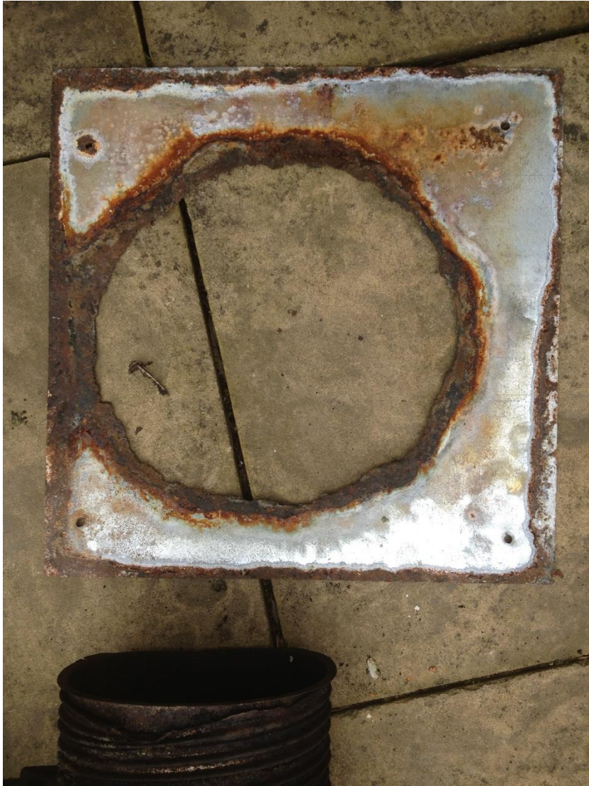
ROTTED TOP PLATE AFTER 3 MONTHS USE