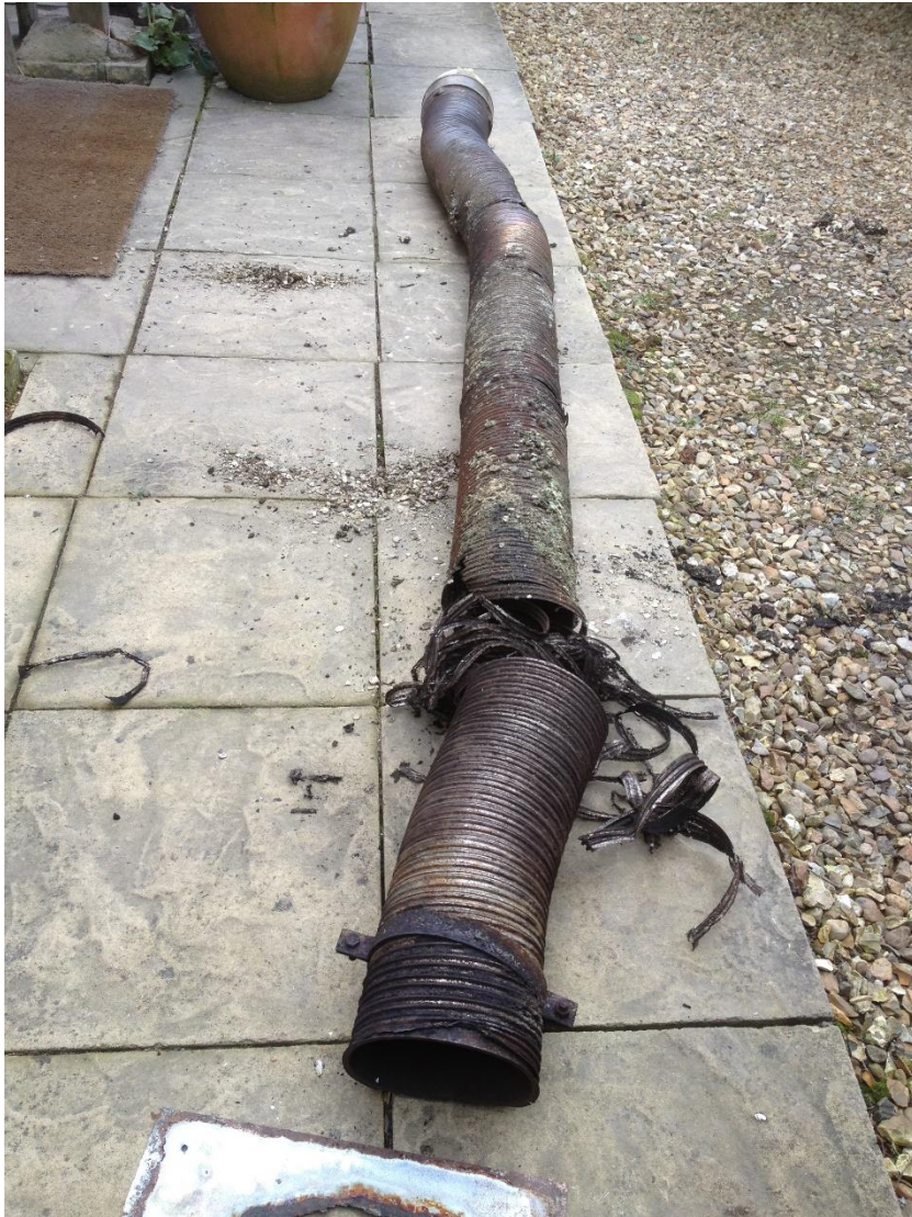
904 GRADE LINER AFTER 3 MONTHS USE